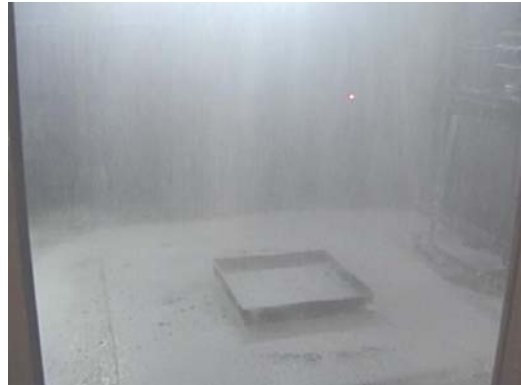
@ 1 minute: 40 s