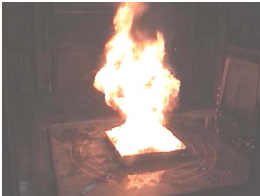
Dual System activation

In Tests 14 to 16 the effectiveness of the CAF with sprinklers in synchronous operation was demonstrated through a wide range of sprinkler densities on heptane fires. All three tests had good extinguishment times (Figures 7 and 8) and they all passed the first torch test. In order to test the resiliency and strength of the foam blanket additional water was added for 5 minutes and the torch test was performed again for Tests 15 and 16. In Test 15 another 5 minutes of water was applied and the torch test was performed once again and it passed. A third extra sprinkler cycle was attempted but after two minutes a hole started to appear in the foam blanket. This represents 17 minutes of sprinkler application at 16.3 L/min/ m 2 (0.4 gpm/sq ft) on the CAF blanket before the surface of the fuel was exposed and a total of 22 minutes of sprinkler application from the initial CAF and sprinkler activation.