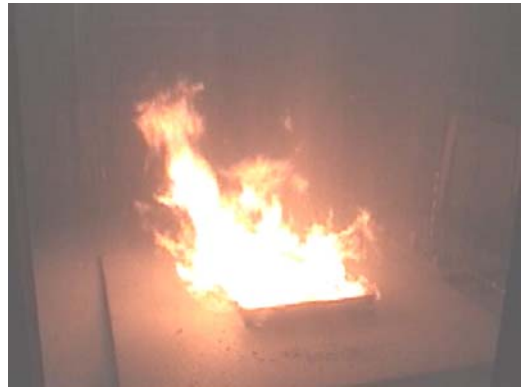
@ 30 s