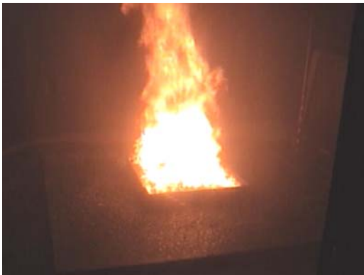
@ 2 minutes