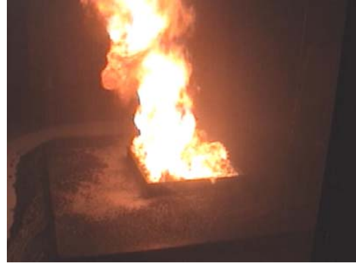
@ 1 minute