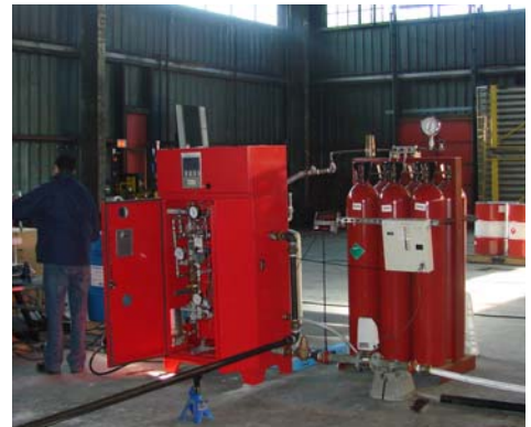
Figure 1. CAF and Sprinkler Piping Layout and CAF Generator