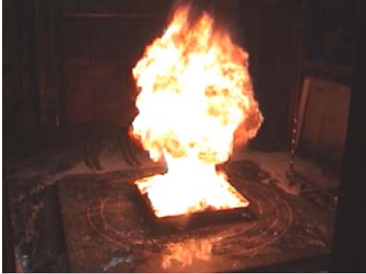
Dual System Activation