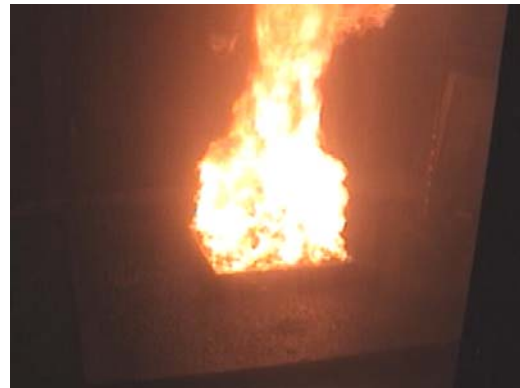
@ 3 minutes