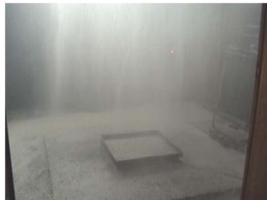
@ 2 minute: 48 s