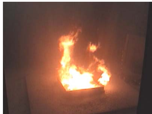
@ 1 minute: 30 s