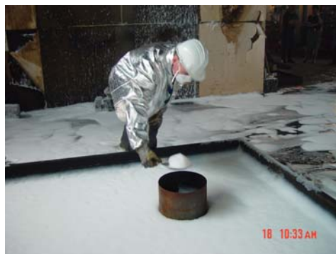
Figure 4. Burn back preparation

After passing both of the torch tests, a burn-back test is conducted. A 0.3m (1ft) diameter stovepipe is placed approximately 0.76m (2.5 ft) from each of two adjacent sides of the test pan, in the corner where the flame extinguished last, and placed in such a manner that the foam blanket is not disturbed. The portion of the foam blanket that is enclosed by the stovepipe is removed (Figure 4), and the fuel inside the stovepipe is ignited and allowed to burn for 1 minute.