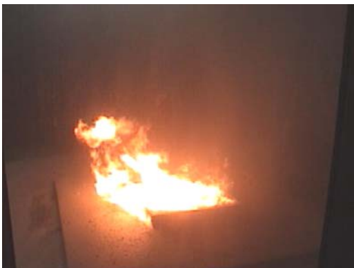
@ 2 minutes