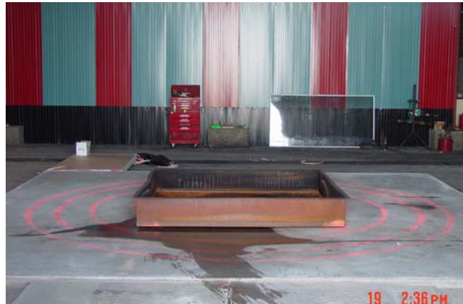
Figure 2. Test Pan

There were two test fires for this series. There was a heptane pool fire with commercial grade heptane fuel in a fire test pan that was placed on the floor, centered below the piping grid of the sprinklers and the rotary CAF nozzles. There was also an acetone pool fire 99.5% pure in a fire test pan located at the same place as the heptane fire. The test pan is the one described in the UL 162 and FM 5130 standards. The pan was square, straight-sided, with an area of 4.65 m 2 (50 square feet), and made of 6.4 mm (¼ inch) thick steel plate (Figure 2).