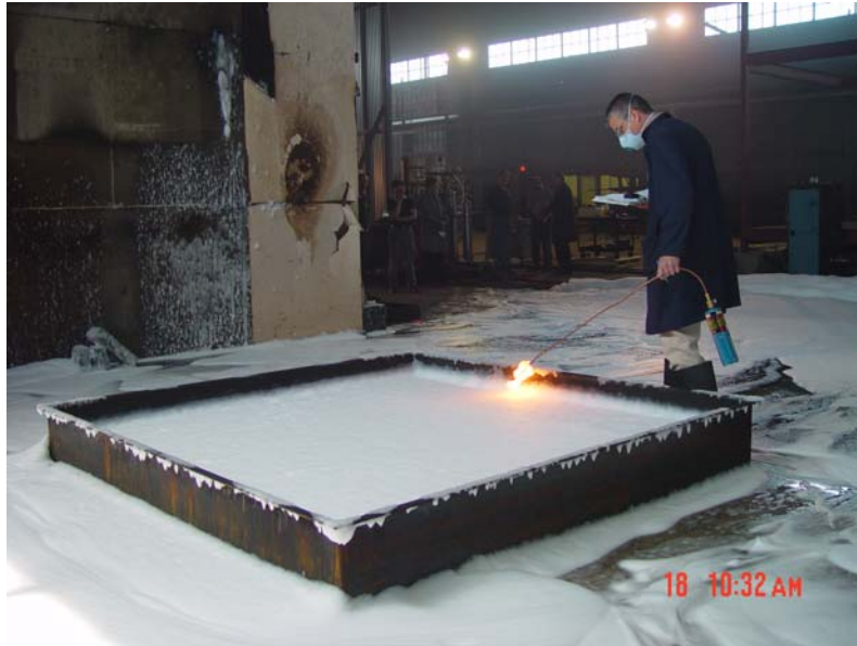
Figure 3. Torch Test

For the FM 5130 test sequence, the fuel in the test pan is ignited and the fire is allowed to burn freely for a 15 second pre-burn. At the end of the 15 second pre-burn the CAF application starts and continues for 5 minutes until automatic shut-down. After the CAF discharge is complete the sprinklers are activated at 10.2 L/min/ m 2 ( 0.25 gpm/ sqft ) and left on for an additional five minutes. After the 5 minutes of water application 2 torch tests are conducted. One immediately after the sprinklers are turned off and again 5 minutes later. This consists of a lighted torch passing approximately 25.4 mm (1 in) above the entire foam blanket, in an attempt to re-ignite the fuel. Each torch test lasts for a period of not less than 1 minute (Figure 3).