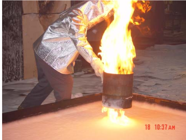
Figure 5. Burn-back starts

The stovepipe is then slowly removed from the pan while the fuel continues to burn (Figure 5).