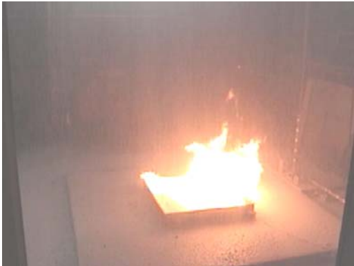
@ 1 minute