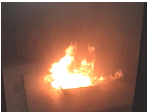
@ 1 minute