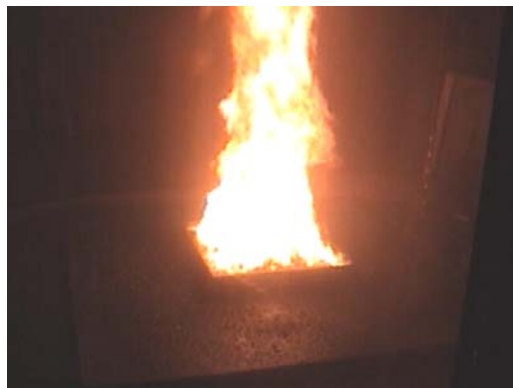
@ 4 minutes